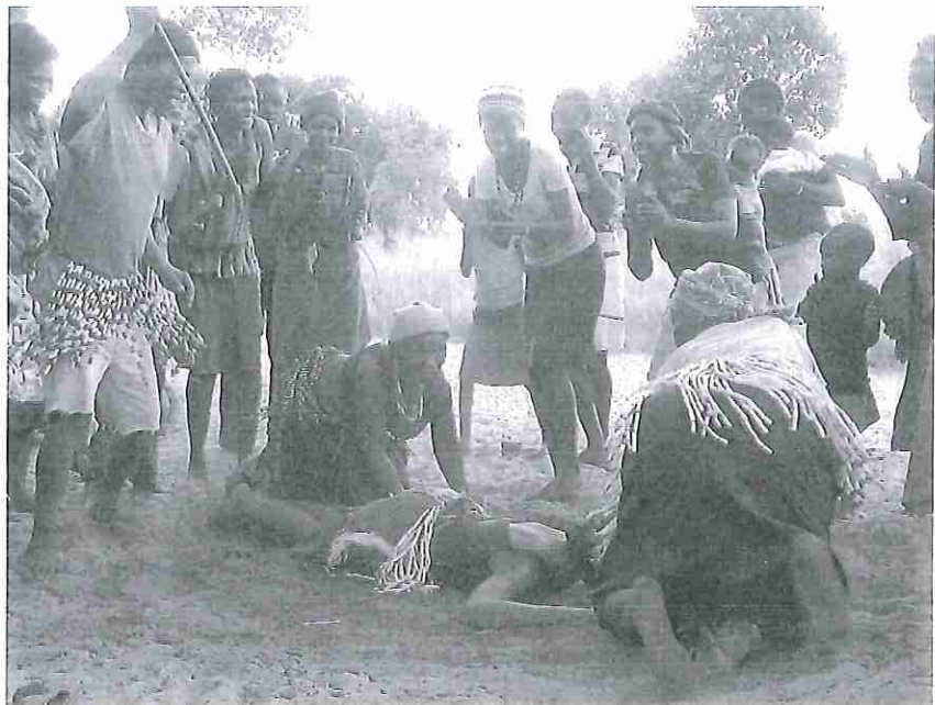
Fig. 2: Khwe in Chetto trying to make a living from tourism.

Also in international conservation politics the Khwe were sidelined when the Kavango Zambezi Transfrontier Conservation Area (KAZA TFCA) was established in 2011. Covering Angola, Namibia, Zambia, Botswana and Zimbabwe, Bwabwata is at the heart of KAZA, for which negotiations had been going on for almost a decade (a Memorandum of Agreement was signed in 2006 between the five countries). The creation of KAZA has increased plans for nature conservation and tourism, with the rationale, just as in CBNRM, that local marginalized people will be able to benefit through jobs. Although support is there from big environmental